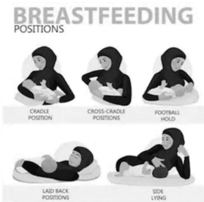
FIG. 3. Breastfeeding positions.