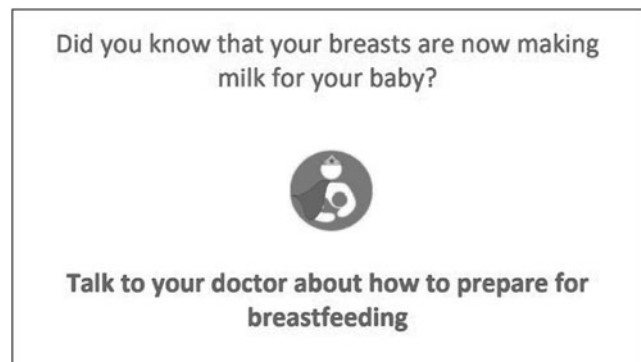
FIG. 5. “You are making milk” given to Crozer-Chester Medical Center patients after 20 weeks during an anatomy ultrasound. Created by Dr. Swathi Vanguri.

Physician interaction with the breastfeeding dyad in the immediate postpartum period depends on the system of health care and insurance systems within the country. For example, if you are in a system in which you see infants while in-hospital, you can collaborate with local hospitals and maternity care professionals within your community 50,51 and provide your office policies on breastfeeding initiation within the first hour after birth to delivery rooms and newborn units.