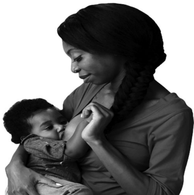
FIG. 2. An example of racially and ethnically diverse images depicting breastfeeding in a positive light.

The following are examples of racially and ethnically diverse images depicting breastfeeding in a positive light (Figs. 2–4).