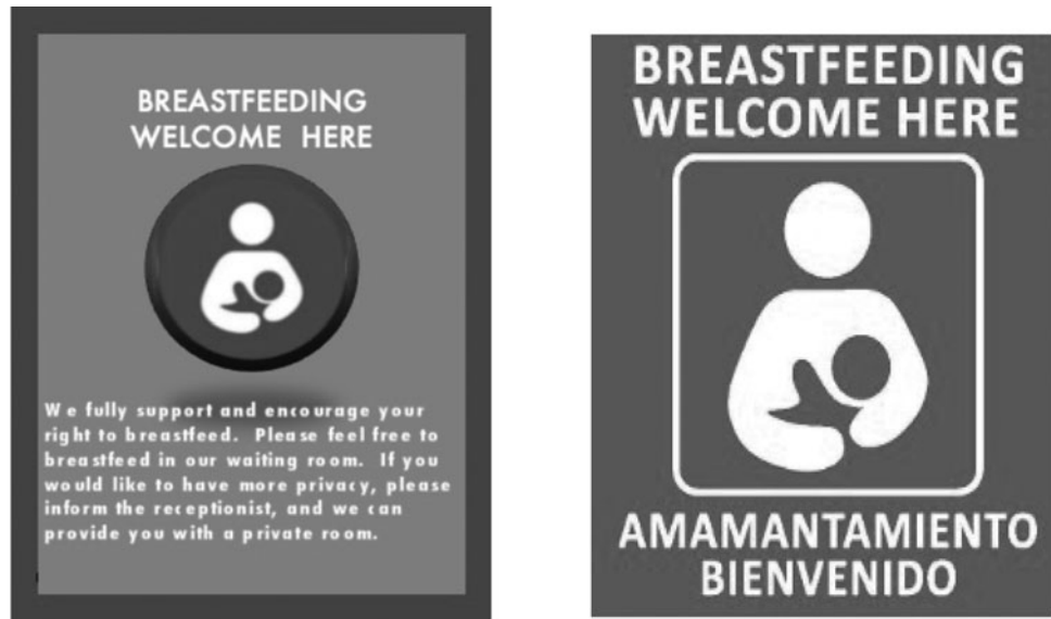
FIG. 1. (Left) Sign created for Center for Women’s Health at Silverside of Prospect-Crozer Health System. (Right) Sign created by Virginia Department of Health. Created by Dr. Swathi Vanguri.

(Norway). 23 Longer maternity leave versus delayed return to work has been shown to increase the duration of breastfeeding. 24,25