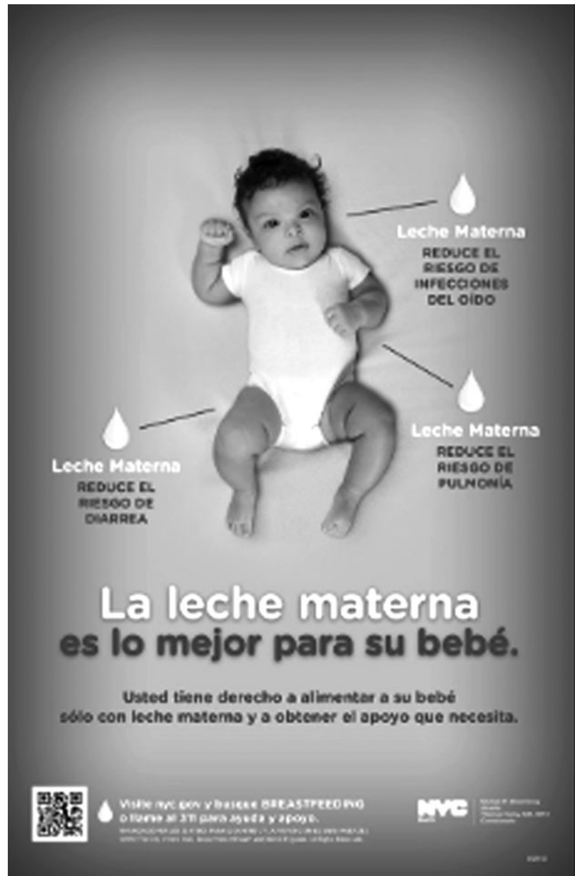
FIG. 4. New York City Department of Health poster, 2012.

while breastfeeding, and the effects on the infant. 48,49 Anecdotal evidence shows that mothers will discontinue breastfeeding while on antibiotics, antidepressants, or antiepileptics either as a result of direct instruction or assumption about the risk to their infant. They should be educated early that many common medicines are safe to use while breastfeeding, and at the very least enlightened about available resources to verify which medicines are compatible with breastfeeding.