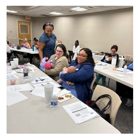
MS CHAMPS hospital training (August 2023)

Boston, MA, February 2024 – Mississippi CHAMPS, a program of the Center for Health Equity, Education, and Research (CHEER) at Boston Medical Center, has won a third consecutive national award for reducing racial disparities in breastfeeding. MS CHAMPS (Communities and Hospitals Advancing Maternity Practices) is one of only five US programs to receive the Reducing Disparities in Breastfeeding Innovation Challenge Phase 3 award, created by the Office on Women's Health to reward programs that increase breastfeeding rates, decrease disparities, and successfully expand in the United States. After winning a Phase 1 award in 2021 and a Phase 2 award in 2023, CHAMPS has now received all three prizes in the challenge, totaling $100,000.