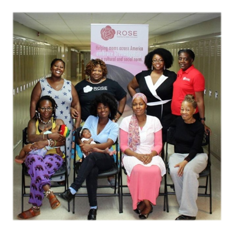
ROSE Community Transformers training

Expanding steadily, CHAMPS has worked with American Indian/Alaska Native populations, states in the South, and especially Mississippi, where the number of Baby-Friendly designated hospitals increased from 0 to 29, with over 75% of the state's births now in Baby-Friendly hospitals.