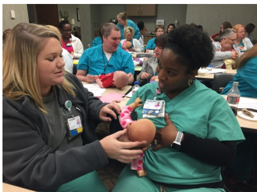
CHAMPS hospital training

Boston, MA, June 2023 – Mississippi CHAMPS, a program of the Center for Health Equity, Education, and Research (CHEER) at Boston Medical Center, has won a second national award for reducing racial breastfeeding disparities in Mississippi. MS CHAMPS (Communities and Hospitals Advancing Maternity Practices) is one of 10 US programs to receive the Reducing Disparities in Breastfeeding Innovation Challenge Phase 2 award, created by the Office on Women's Health to reward programs with a track record in increasing breastfeeding rates and decreasing disparities. CHAMPS was previously one of 15 awardees to receive the Phase 1 award in September 2021. As a Phase 2 awardee, CHAMPS received a prize of $30,000 and has an opportunity to advance to the final phase.