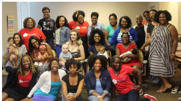
ROSE Community Transformers training

Mississippi partners include Blue Cross and Blue Shield of Mississippi, Reaching Our Sisters Everywhere (ROSE), Every Mother, the Mississippi Perinatal Quality Improvement Collaborative, and the Mississippi Women, Infants and Children's Nutrition Program (WIC). MS CHAMPS has also received funding from the W. K. Kellogg Foundation, the Robert Wood Johnson Foundation, and the Bower Foundation.