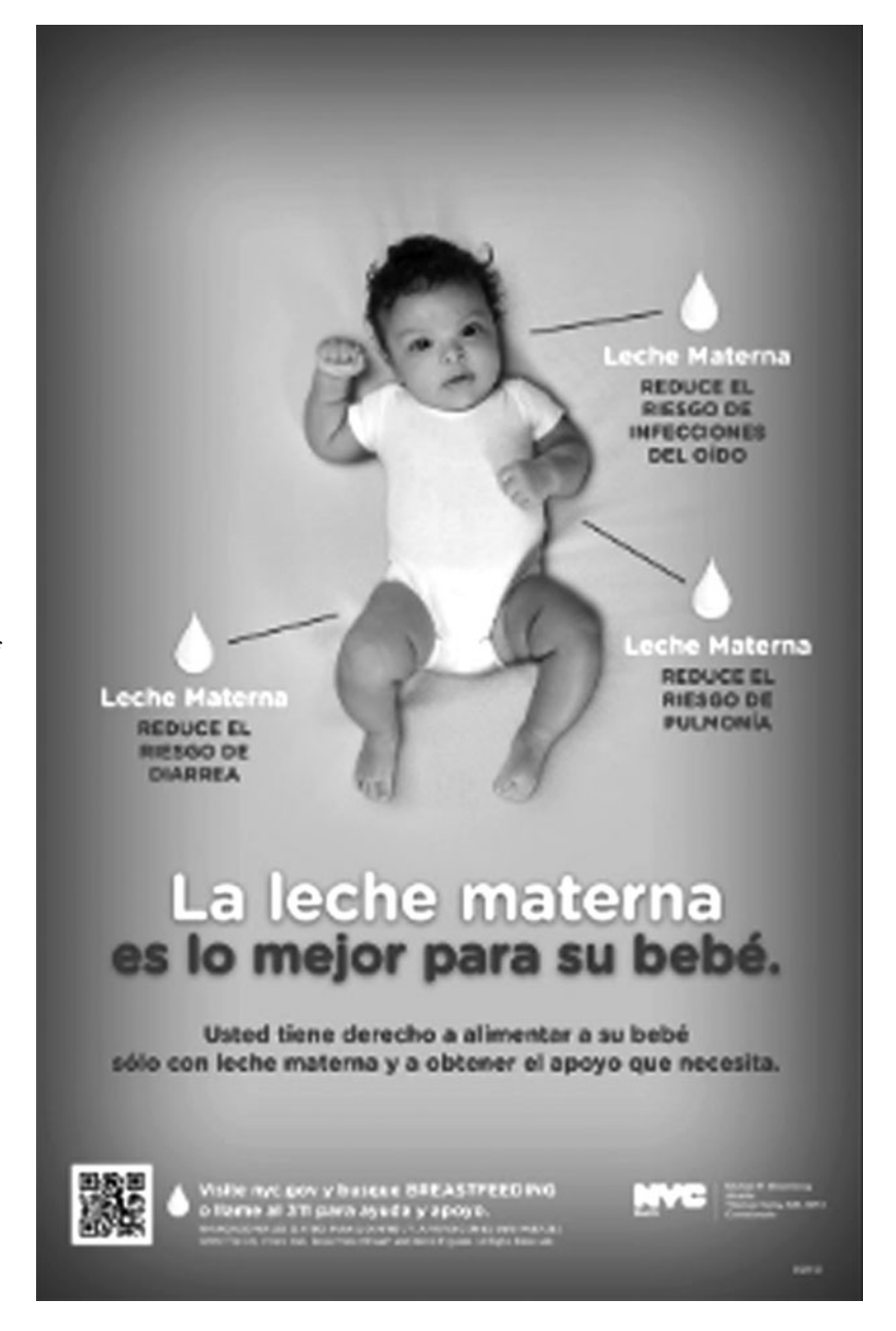
FIG. 4. New York City Department of Health poster, 2012.

while breastfeeding, and the effects on the infant. Anecdotal evidence shows that mothers will discontinue breastfeeding while on antibiotics, antidepressants, or antiepileptics either as a result of direct instruction or assumption about the risk to their infant. They should be educated early that many common medicines are safe to use while breastfeeding, and at the very least enlightened about available resources to verify which medicines are compatible with breastfeeding.