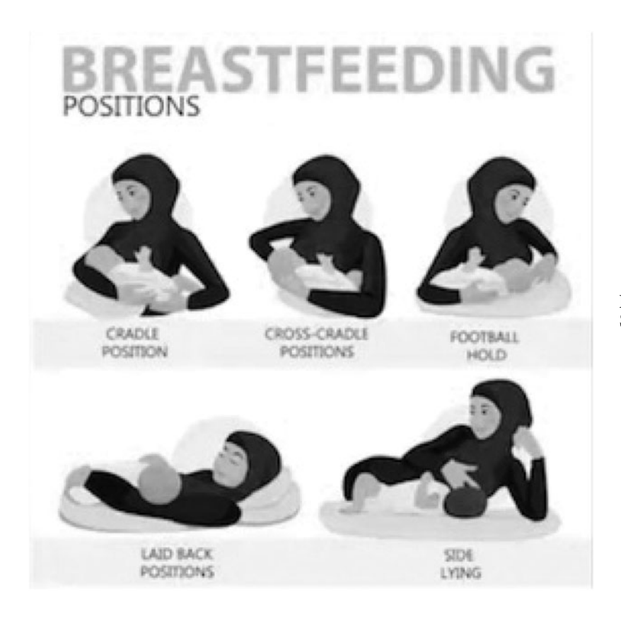
FIG. 3. Breastfeeding positions.