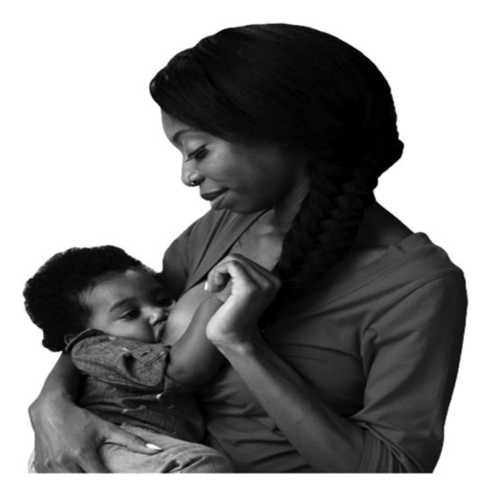
FIG. 2. An example of racially and ethnically diverse images depicting breastfeeding in a positive light.

The following are examples of racially and ethnically diverse images depicting breastfeeding in a positive light (Figs. 2-4).